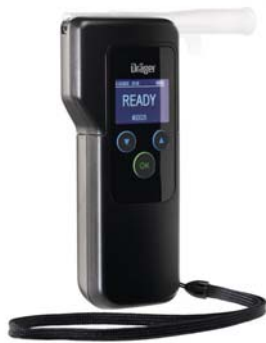
Dräger Alcotest 5820 Professional alcohol testing device

The Dräger Alcotest® 5820 allows the professional user to perform a breath alcohol test with speed and precision. The measuring technology of this small and user-friendly portable measuring device has already proven in over 200,000 units in use worldwide today.