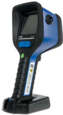
Dräger UCF 9000 Thermal Imaging Camera Easy to use, small, light weight and EX approval

The Dräger UCF 9000 thermal imaging camera is suitable for all yachting and marine apps. The camera can be used for rescue operations, technical assistance, hazmat operations, monitoring as well as search for hot spots and hidden fire.