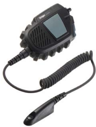
Dräger C-C550 Transmitter with integrated loudspeaker and microphone

Control unit for the tactical transmitter with integrated loudspeaker and microphone. Can be hooked up to a number of receiver models. Its strong and robust design is IP67 / MIL-STD-810G approved. Allows for independent deployments with the radio receiver (also without attached headset). User-friendly with two PTT buttons. ATEX versions available (regardless of radio transmitter type).