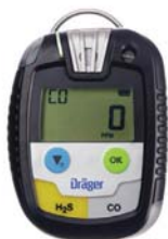
Dräger PAC 8500