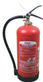
Dräger 6 liter AB composite foam extinguisher Stored pressure

The revolution in portable fire extinguishers: composite extinguishers are the latest development in the quest for durable corrosion resistant and low maintenance extinguishers. The extinguishers have EN3, CE and MED certification and a lifetime of 20 years. Another unique feature: the extinguishing medium in these units needs to be replaced every 10 years as per manufacturer specification. Foam extinguishers cover type A and B fires.