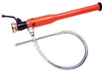
Delta HV225 Branch pipe Self inducing models

Delta's "V" range of foam branch pipes are designed for the foams of the late '90s. All purpose alcohol resistant, FFFP and AFFF foams.