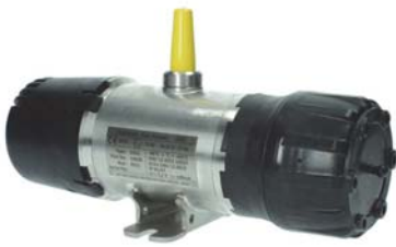
GS01 Hydrocarbon IR Detector

Truly wireless, the GasSecure GS01 combines single-beam triple-wavelength infrared (IR) technology with extremely low power consumption, to provide fast hydrocarbon gas detection in the most demanding and hazardous of settings. The GS01 creates value for the customer with dramatically reduced installation cost and time, reliable infrared operation, and calibration-free design.