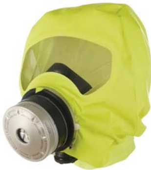
Dräger PARAT 5500 Fire escape hood

The Dräger PARAT® 5500 fire escape hood was developed in cooperation with users – always with the focus on offering the fastest possible escape. Optimized operation and wearing comfort, a robust housing and a tested CO P2 filter guarantee that the wearer of the Dräger PARAT® 5500 is protected from toxic fire-related gases, vapours and particles for at least 15 minutes while escaping.