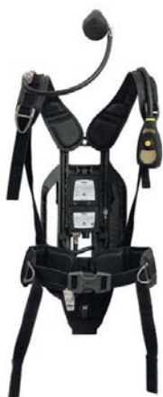
Dräger PSS 7000 For professional firefighting

Developed by professionals for professionals the new Dräger PSS 7000 represents a major leap forward in the evolution of breathing apparatus for the professional fire fighter.