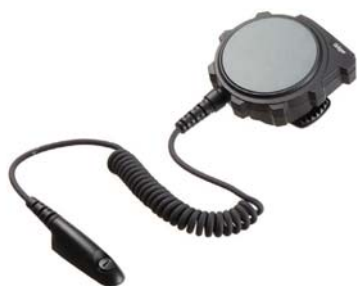
Dräger C-C440 Easy to operate

Control unit with large Push-To-Talk button for easy handling of the radio transmitter. Tough and robust design according to IP67 / MIL-STD-810G standards. Specially designed for deployments using chemical protective suits. ATEX versions available.