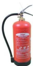
Dräger 6 kgs ABC composite powder extinguisher Stored pressure