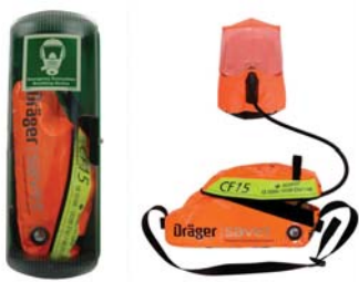
Dräger Saver CF15, with storagebox

The Saver range of Emergency Escape Breathing Apparatus has been designed using the latest technologies available whilst still bearing in mind our three leading principles; reliability, quality and ease of use. The Saver CF constant flow emergency escape breathing apparatus allows safe, effective and uncomplicated escape from hazardous environments with the minimum of user training.