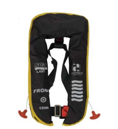
Hansen Sea Lion Life Jacket Inflates automatically when it comes in contact with water

The Hansen Sea Lion Life Jacket is specially designed for use as a combined working/abandonment life jacket.