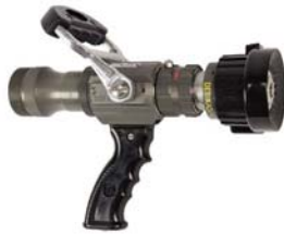
POK 400 DIN Spray Nozzle Tough construction

We believe that POK products have the ability to provide firefighters all over the world the proper tools to save lives and to minimize property damage.