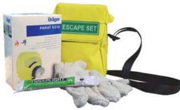
Personal Grab Bag Personal escape aid

Grab bag with personal escape aid to abandon the installation in case of a fire. The personal grab bag is to be used in the event of a fire.