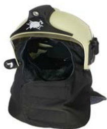
Dräger HPS 7000 fireman's helmet Tailor- made for every head

The Dräger HPS 7000 firefighter's helmet is in a class of its own thanks to its innovative, sporty and dynamic design, ergonomic fit and components which make it a multi-functional system solution. It provides you optimum protection during every operation.