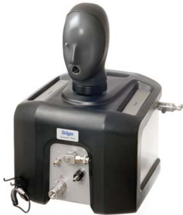
Dräger Quaestor 7000 Fully-automatic static and dynamic tests

All static and dynamic tests of the Dräger Quaestor 7000 are carried out fully automatically. Controlled by the newly developed software, each test is carried out intuitively. For the user this guarantees high efficiency through comfort and speed.