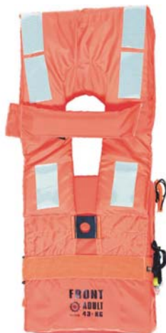
Hansen Sealife Life Jacket For a compact fit

Hansen Sealife Life Jacket has a practical, space-saving design, which makes for a compact fit in onboard cabinets. The volume is 30 to 35% less than most of other life jackets.