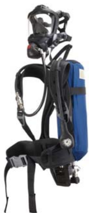
Dräger PSS Merlin System Lightweight yet robust and easy to don

The Dräger PSS® Merlin® Telemetry System offers a precise overview of the status of respiratory equipment wearers. The vital status information is communicated directly between the entry control point and the wearer. Technology, which supports the incident, significantly increases safety and protects the lives of your breathing apparatus wearers.