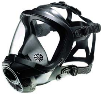
Dräger FPS 7000 Large field of vision

The Dräger FPS 7000 full-face mask series sets new standards in terms of safety and wearing comfort. Thanks to its enhanced ergonomics and the availability of multiple sizes, it offers a large, optimized field of vision and a very comfortable, secure fit.