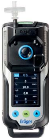
Dräger X-am 8000 Up to 7 toxic measurements

Clearance measurement was never this easy and convenient: the Dräger X-am® 8000 measures up to seven toxic as well as flammable gases, vapours and oxygen all at once — either in pump or diffusion mode. Innovative signalling design and handy assistant functions ensure complete safety throughout the process.